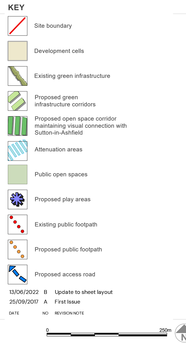
Figure 7 Landscape and Green Infrastructure Strategy Newark Road, Sutton-In-Ashfield